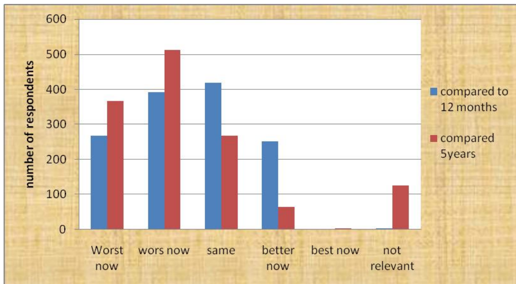
Fig. 3: Food security status, ANRS

Comparing the response of the survey participants regarding their living standard between five years ago and the last twelve months, the number of worst or worsen now is lower in the last twelve months. In general, the graph below indicates that there is no improvement regarding the living standard.